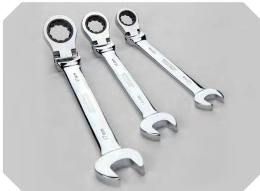
ART NO.:137301 FLEXIBLE HEAD RATCHET SPANNER