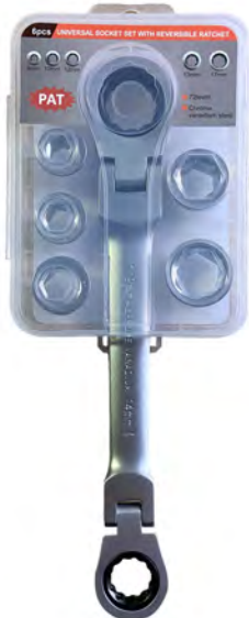
7 in 1 Flexible Head Ratchet Wrench Set