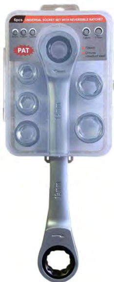
7 in 1 Fixed Head Ratchet Wrench Set