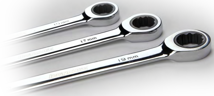
ART NO.:137201 RATCHET SPANNER