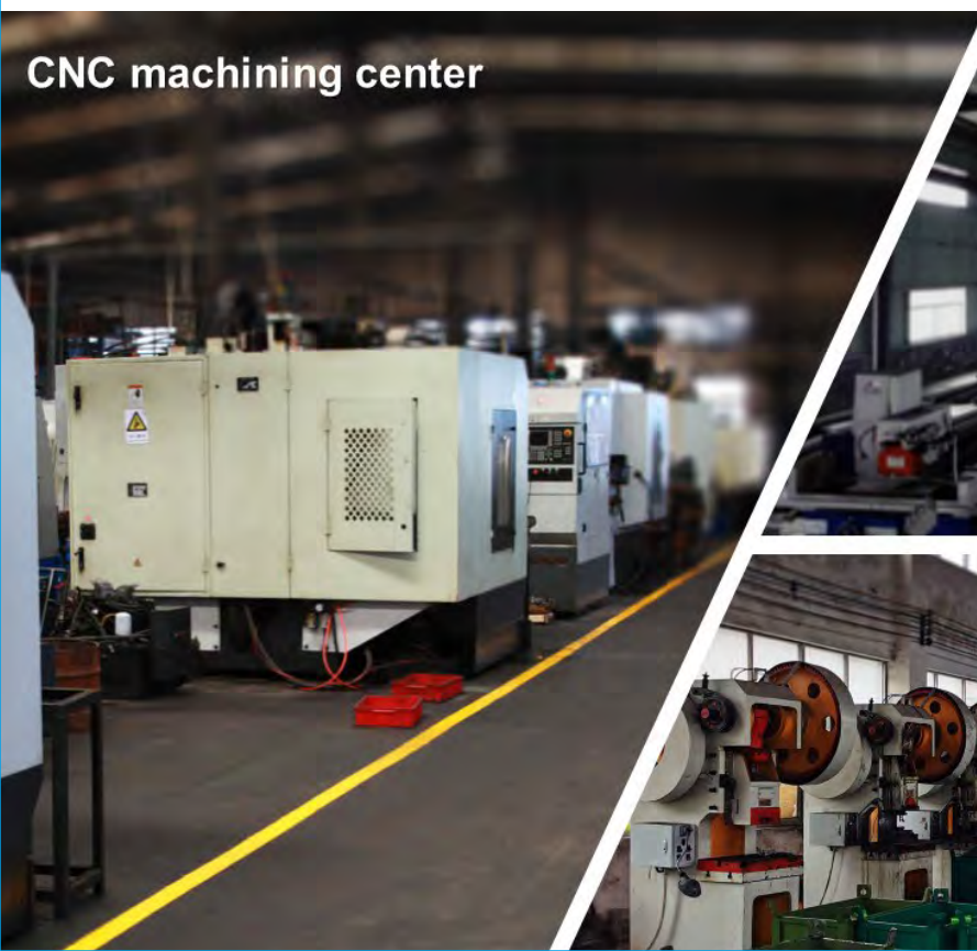
CNC machining center

We focus on making high quality wrench and other tools with excellent service to ensure our customers satisfaction.