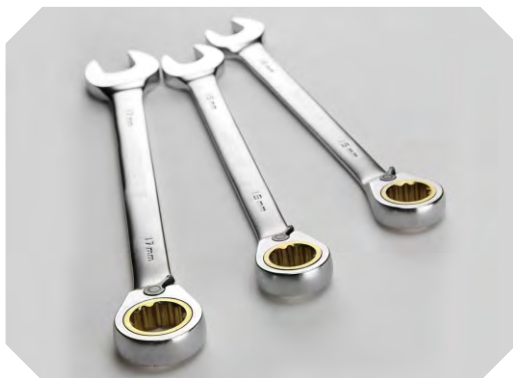
ART NO.:137403 REVERSIBLE RATCHET SPANNER