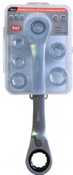
7 in 1 Reversible Ratchet Wrench Set